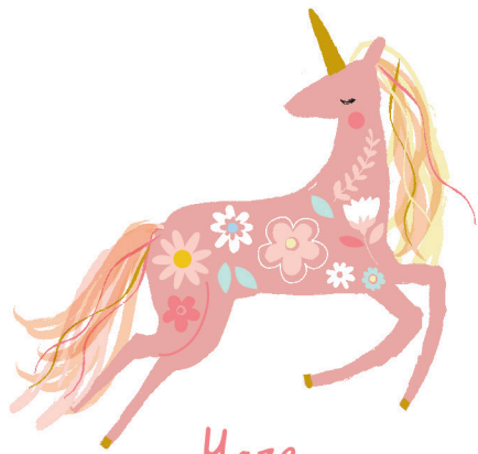
Haze curious & carefree