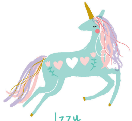
Izzy cheeky & talkative