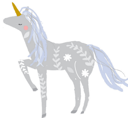
Galina quiet and wise