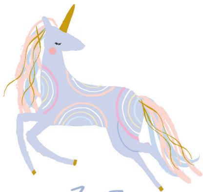
Zara fashionable & funny