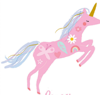
Peggy gentle & thoughtful