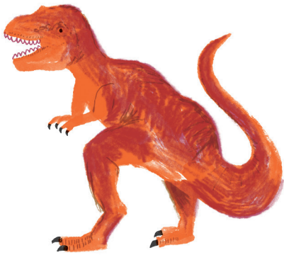
TYRANNOSAURUS REX tai-ra-nuh-saw-ruhs--rex