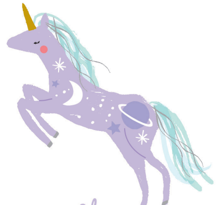
Cleo intelligent & patient