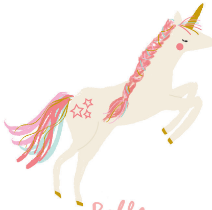
Bella cute & fun