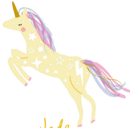
Jade independent & adventurous