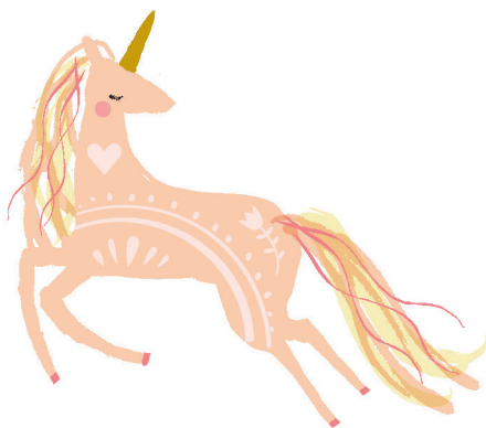
Amber energetic & brave