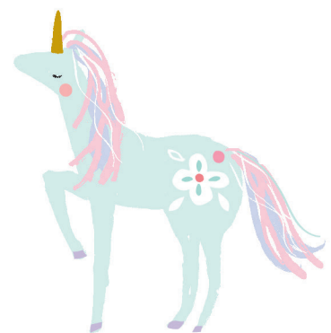
Dot shy & lovable