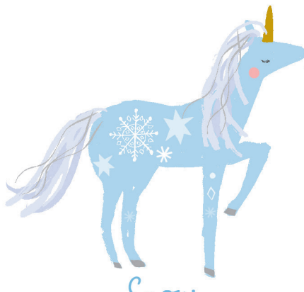
Snow bossy & moody