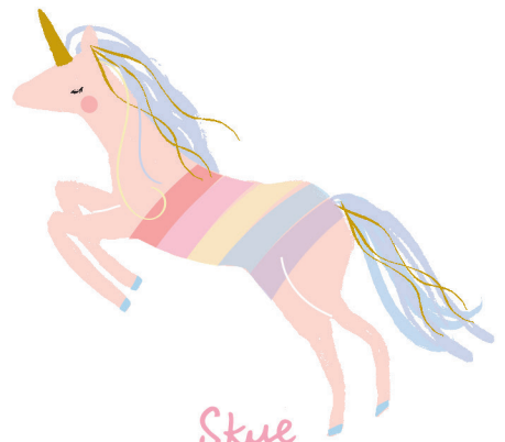
Skye lucky & creative